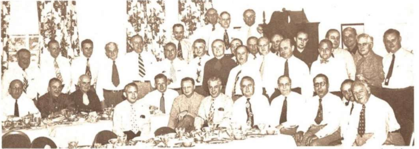
Boy, what a breakfast.

Taken from E. Carl Sorby PM IV GILD Chronicles 1949-1951: