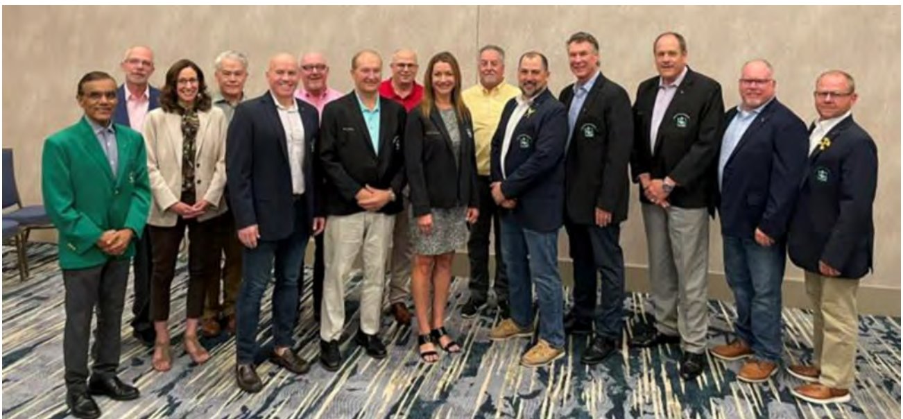
2025-2027 GILD Officers pose for a group photo