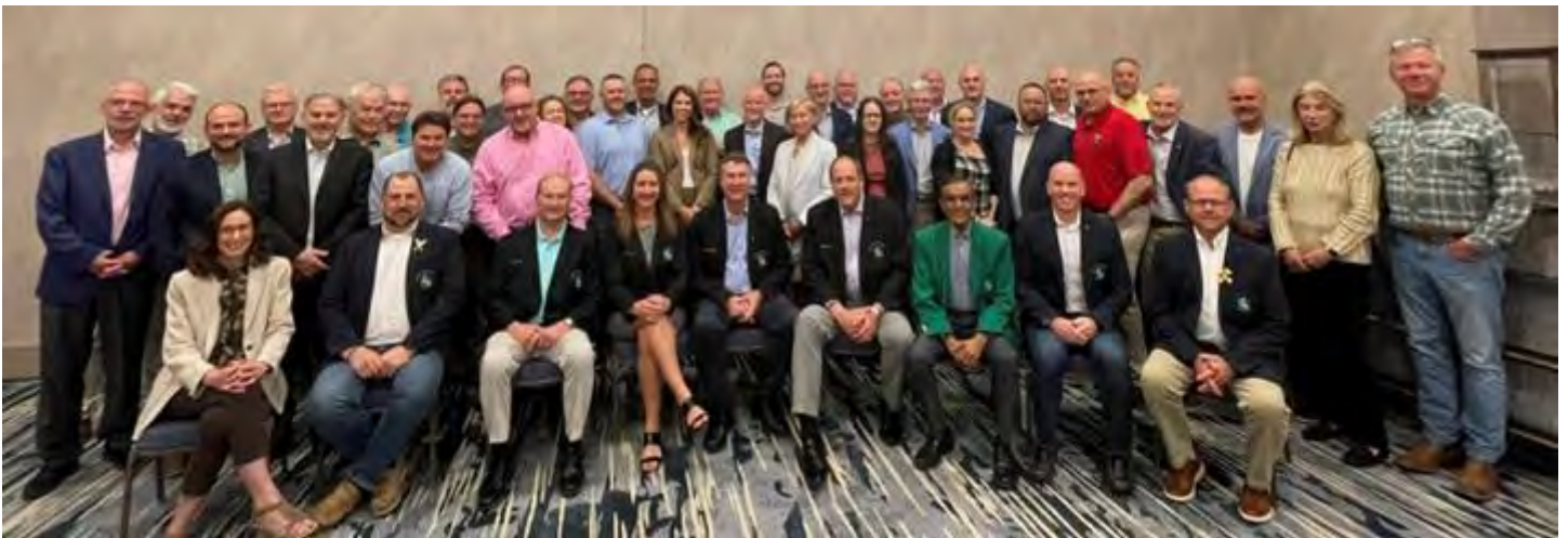
The breakfast ends with a gathering of all Suppliers who attended the AGA GILD Burgher Breakfast to pose for a picture for the GILD Sidebar & Chronicles.