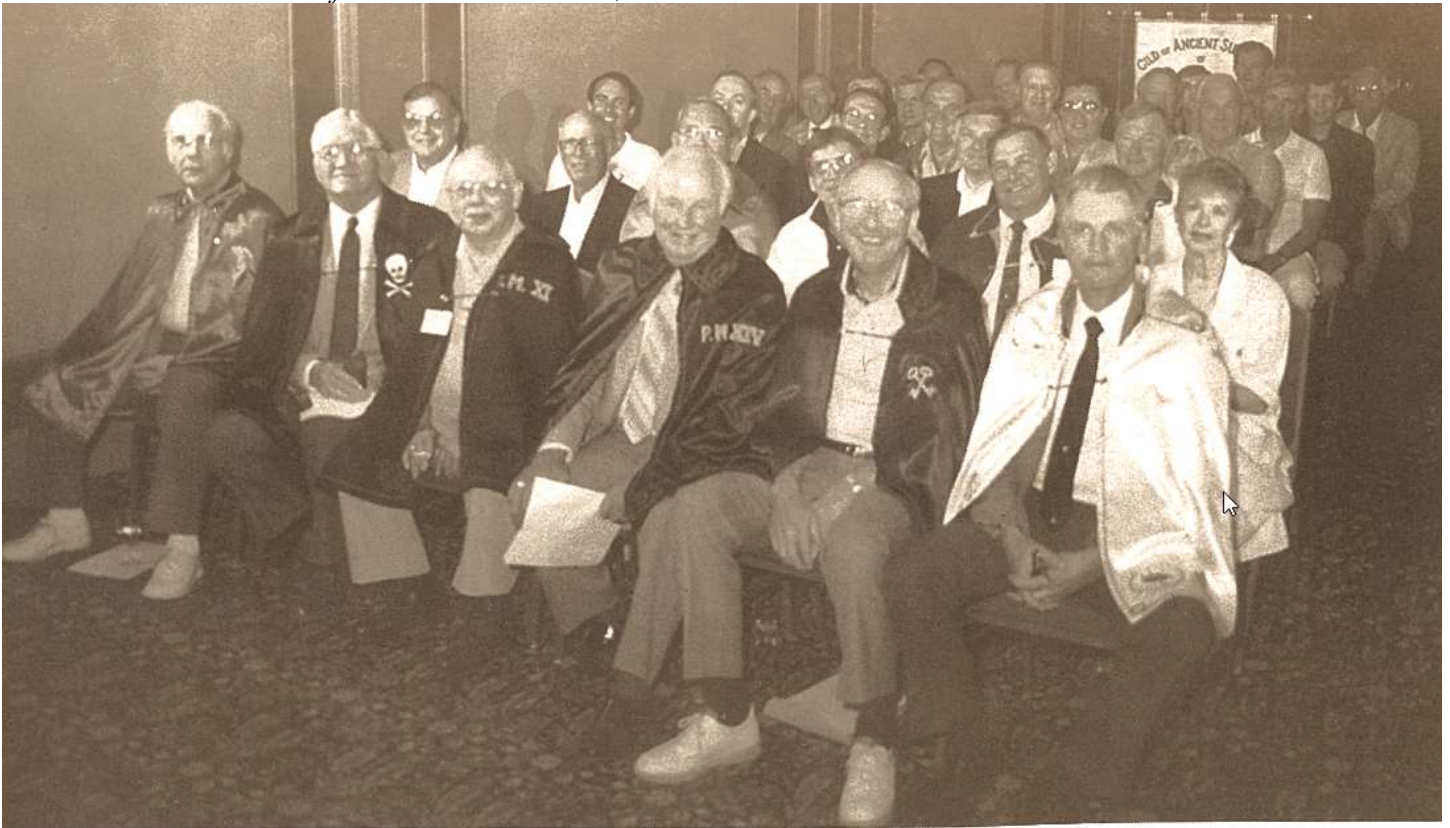
5/88, Annual Meeting, Boca Raton