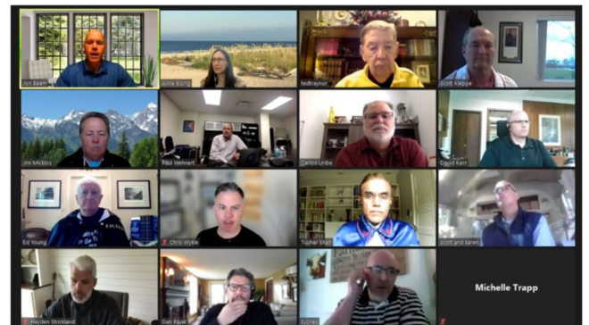
AGA Spring Committee Meetings Virtual Gild Gathering April 28, 2021

I would like to say what an honor and privilege it has been to lead this team of incredible people. I can't say enough about the effort of the Wardens, Alderman, Special positions, and the Officers have put forth to keep the Gild ALIVE! As we have all been through very challenging times and despite everything for the last 18 months done virtually, I am proud to say that because of everyone's help I can move on to PM XXXVII knowing the Gild in a great place for the future.