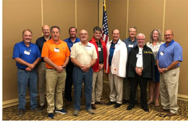
MEA Gild Breakfast Rochester Civic Center, Rochester, MN August 16, 2018