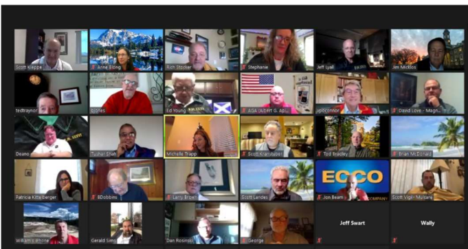
Mayor's Virtual Holiday Gild Gathering December 11, 2020