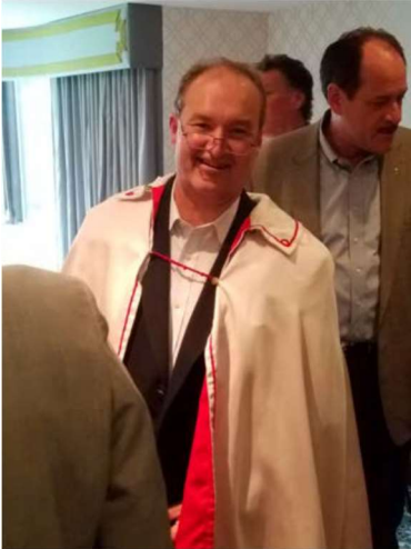
AGA Operations Conference & WGC Gild Burgher Breakfast Washington, DC June 27, 2018