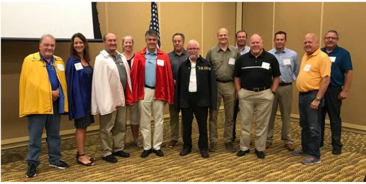
MEA Gas Operations Summit Gild Burger Breakfast Mayo Civic Center Rochester, MN August 15, 2019