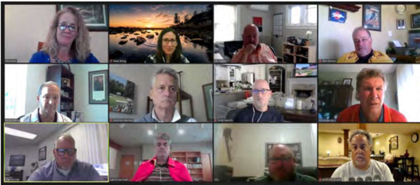
MEA Gas Operations Technical & Leadership Virtual Summit Virtual Gild Gathering August 25, 2020