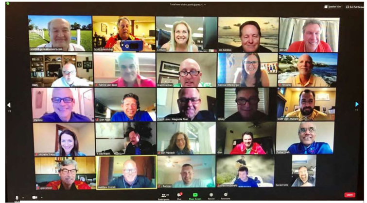
AGA Operations Conference Virtual Gild Gathering June 9, 2020