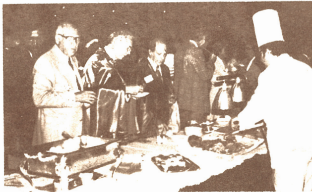
Just look us over. Pretty fancy and delicious. New York was a great place to be.