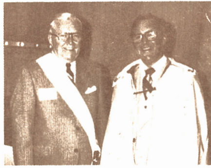
Just call me "Sir" when you see this beautiful sash.