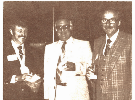
You must be kidding.