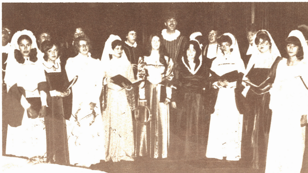
What could be nicer than to be where they were. At New York's wonderful reunion and convention. After all, relaxing and enjoying entertainment is a