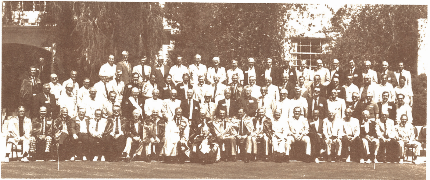
What a terrific get together of officers and reunion in Arizona. If you think these suppliers didn't have a great time, take another look at friendship and industry reunion.