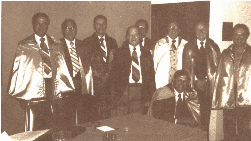
Real Class. Just look us over. We're at a council meeting in Orlando, Florida. For a full review of our Mayor's objectives.