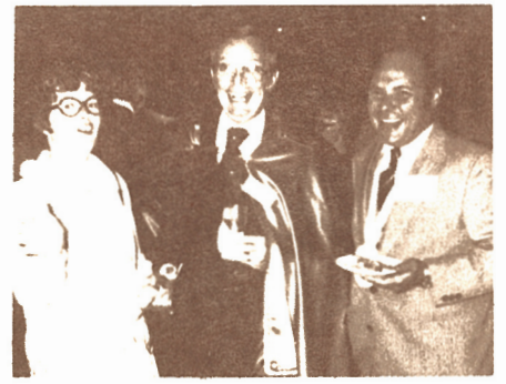
Yes, they are my kind of people in Canada.