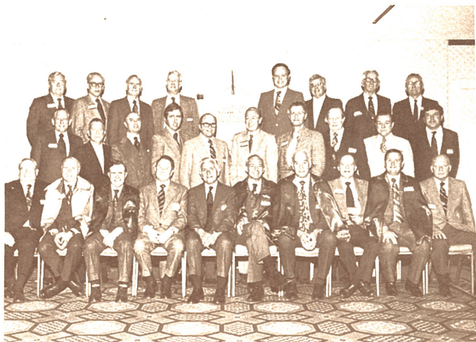
We're all here for you to look at and remember a wonderful luncheon March 22, '77. After this posing bit there was time for Fun and Reunion. What's more enjoyable than suppliers from all over getting together.