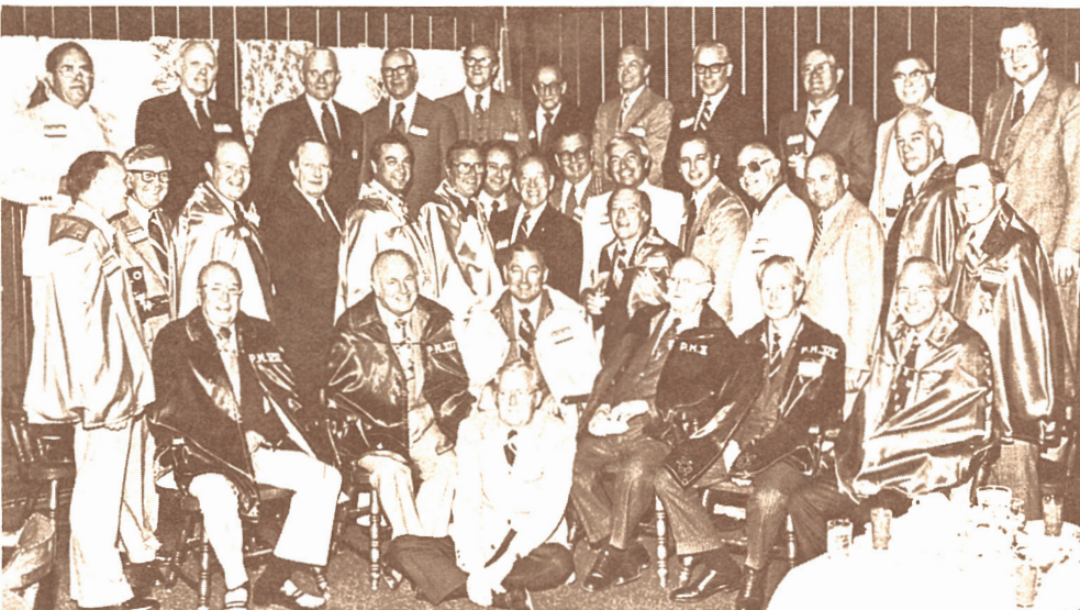
After this we're accepting our bid from Hollywood.