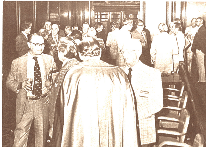
They got up early for this one and like all breakfast eyes became open in the first few minutes. It's wonderful to say good morning to suppliers.