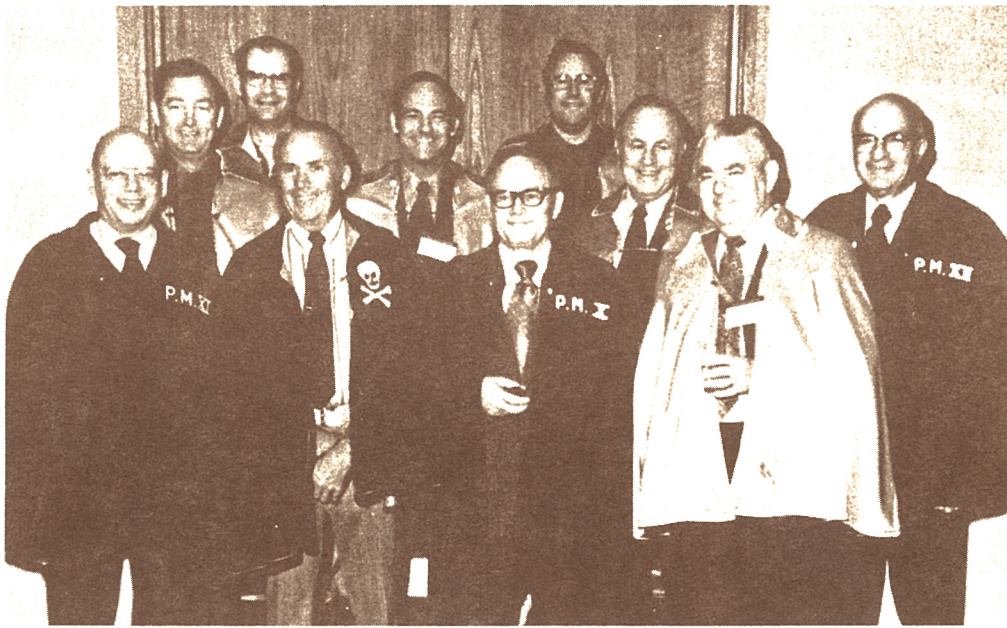
All the Mayor's men and P.M.'s.