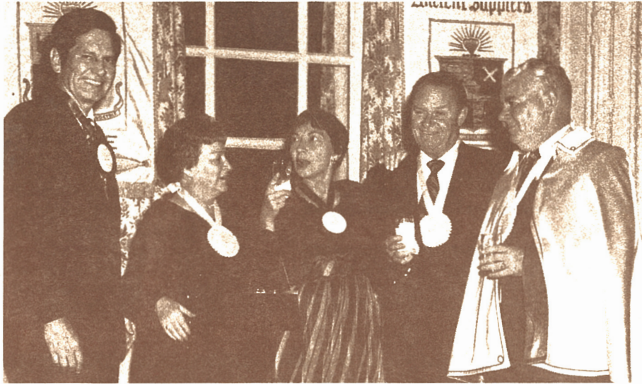
You're pretty, Mr. Mayor . . . and so is your party.