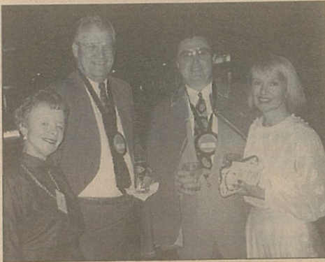
Neeleys and Ducates at AGA Wassail, Chicago Yacht Club