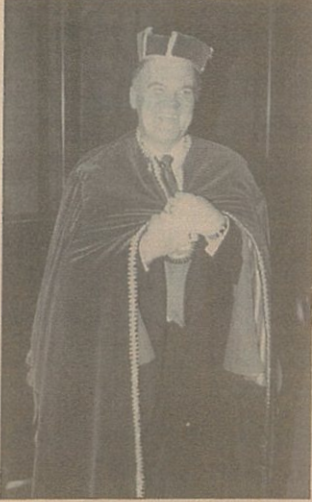
"I really want to be king, not mayor"