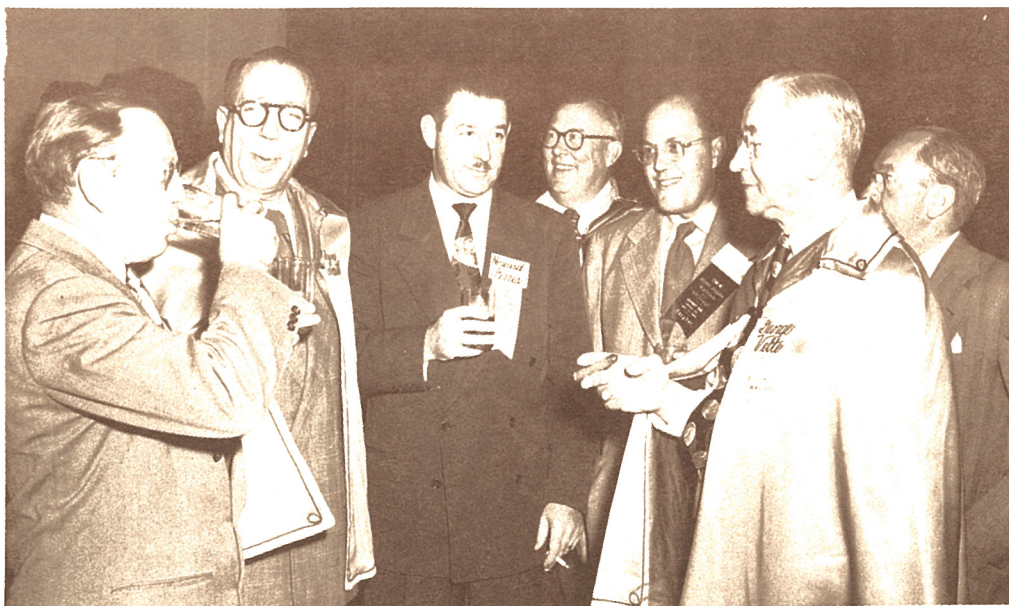
Not an unkind word.