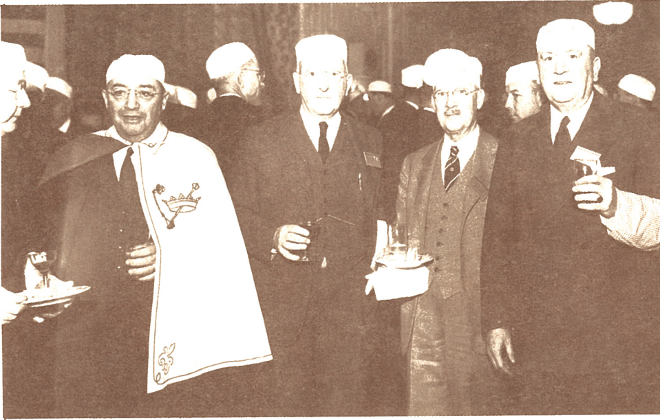
You're sure pretty.