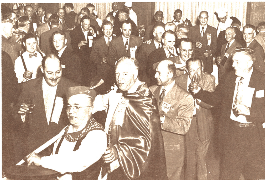
Fun is the name of the game.