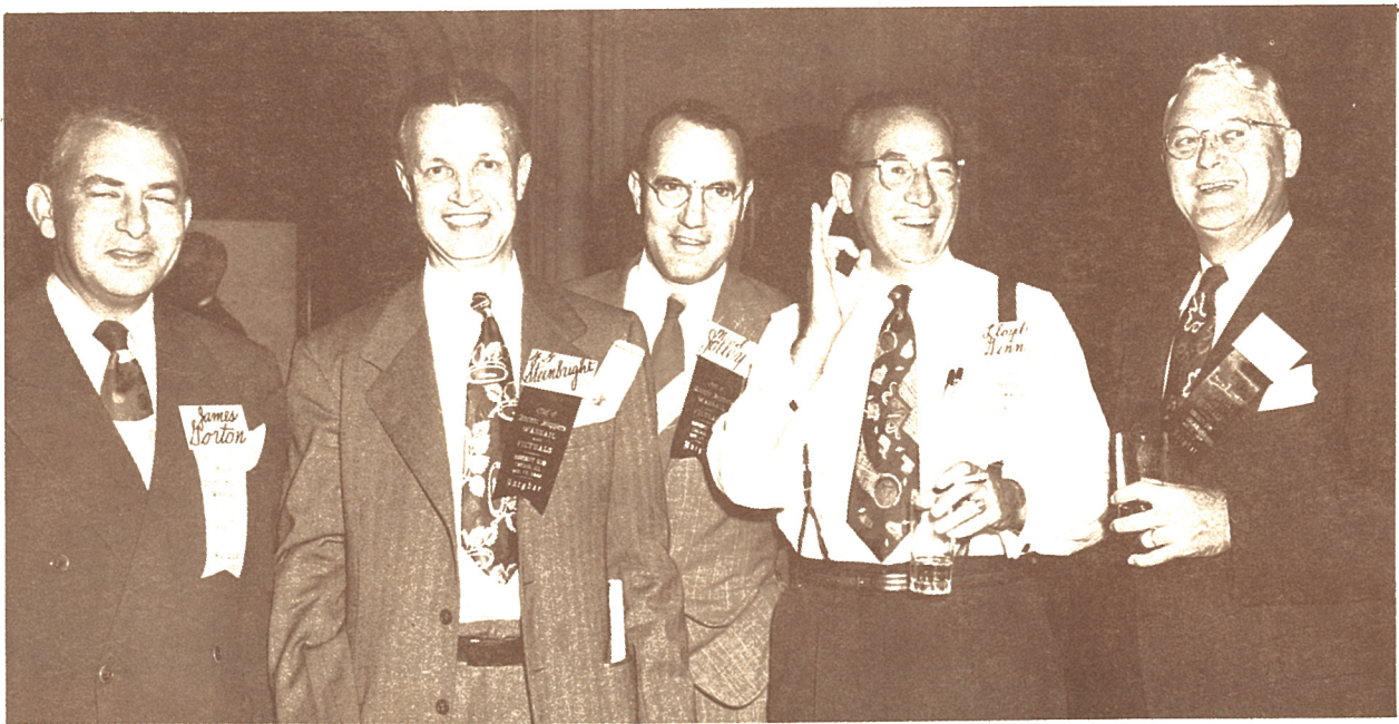
How sweet and beautiful.