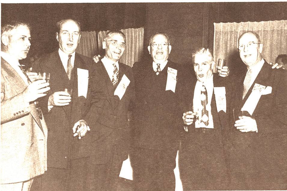
A song in their heart.